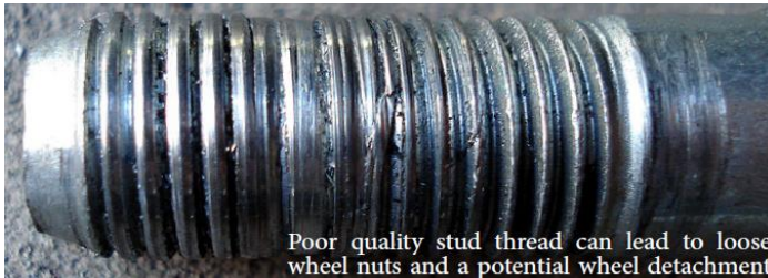
Poor quality stud thread can lead to loose wheel nuts and a potential wheel detachment

Checkthread® is a handy set of tools designed to facilitate the monitoring of wheel stud quality and stud hole integrity, as well as to determine the correct nut type to be used with the wheel. The product should be used when servicing wheels, to help raise awareness of the critical nature of wheel security, its fundamental correlation with the quality of studs / stud holes and to highlight problems to reduce the risk of accidents occurring.